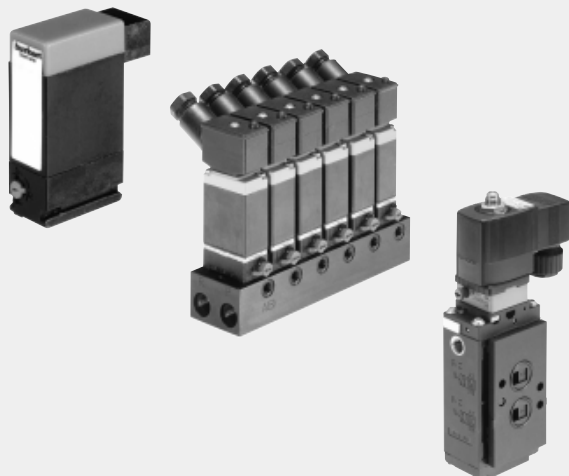
Picture showing 3 examples of intrinsically safe valve systems

Burkert offers a wide range of intrinsically safe solutions for use in hazardous areas. For the power supply of these products an approved barrier is required. This data sheet gives you an overview of approved solutions.