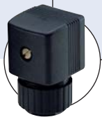
Type 2508 Cable plug