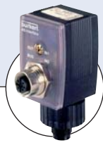
Type 2511 ASI cable plug

Direct-acting plunger solenoid Type 355 for neutral gases and liquids. Also suitable for high temperatures, such as hot water, hot air, steam.