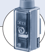
Type 1078 Timer unit